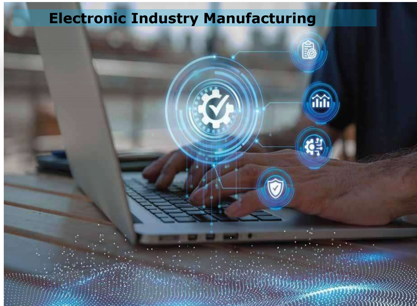
Electronic Industry Manufacturing